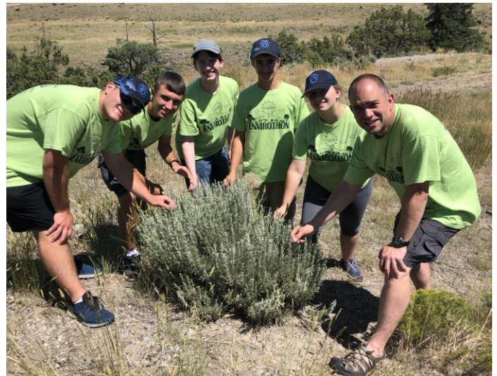
Pennsylvania's Team from Carmichaels Area High School, Greene County, discovers "sage brush."

The 2019 international NCF-Envirothon will be hosted at North Carolina State University in Raleigh, N.C. July 28 – August 2. Students will be tested on the 2019 topic, "Agriculture and the Environment: Knowledge and Technology to Feed the World."